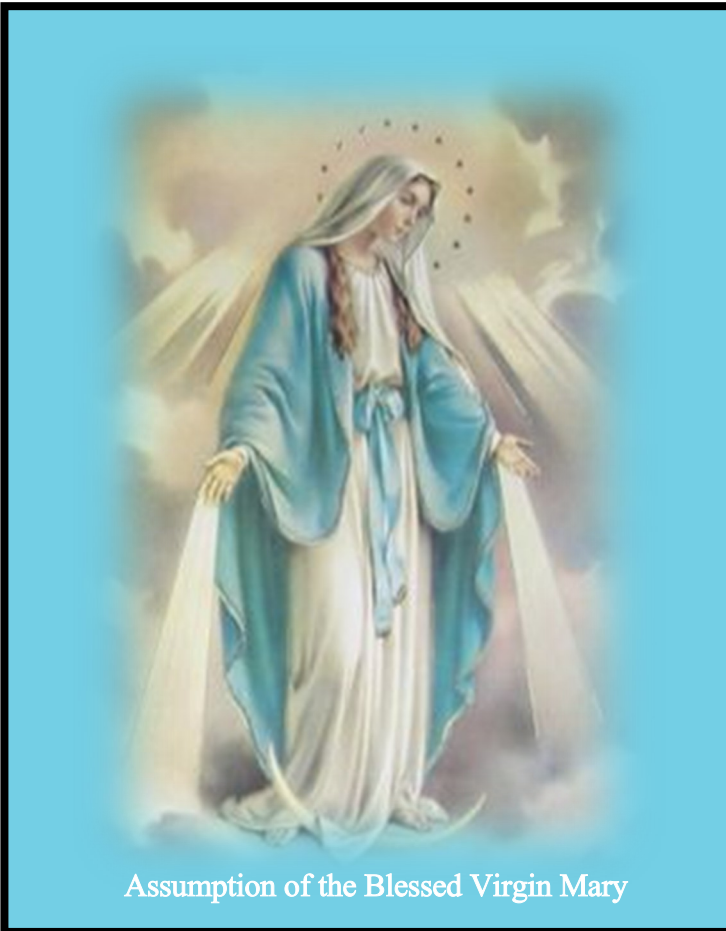
Assumption of the Blessed Virgin Mary