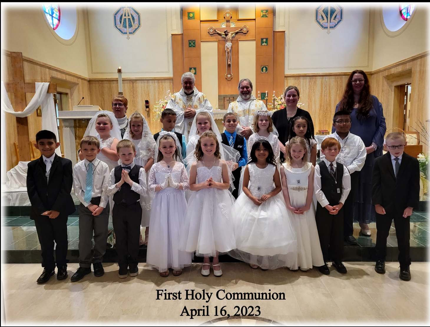
First Holy Communion April 16, 2023

This week, read how Jesus explained how He fulfilled the Old Testament in His Passion, Death and Resurrection, and allowed the disciples to recognize Him in the breaking of the bread in Luke 24:13-35.