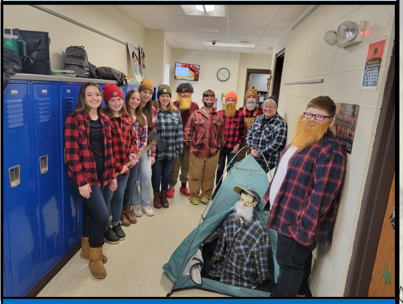
Class Unity Day Theme Lumberjacks

"It is ok to look fancy on the outside but what is important is to be holy on the inside" Msgr's message to the youth