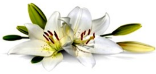
Easter Memorial Flowers