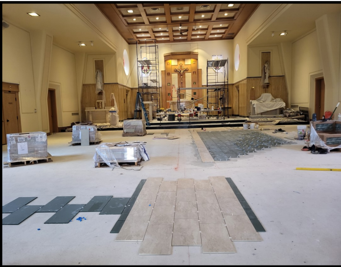
The beginning of the New Church floor 03/01/2023