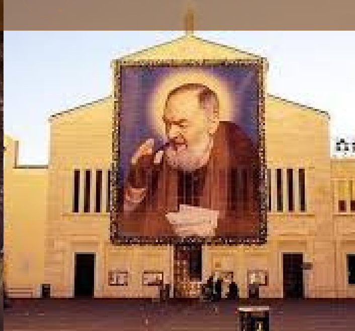
4 Basilica of St. Padre Pio