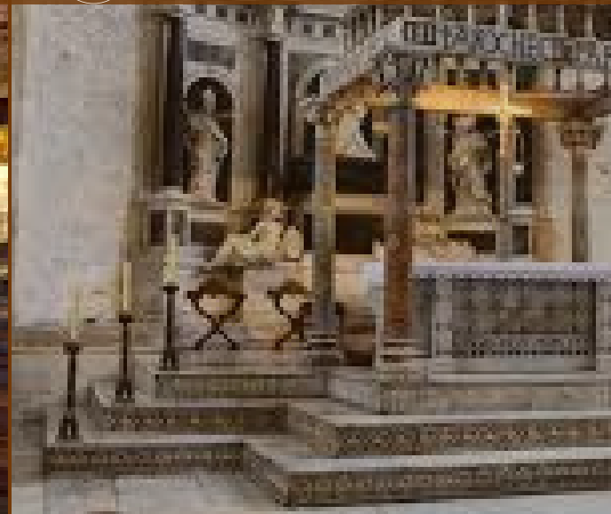
5 Basilica of St. Nicholas