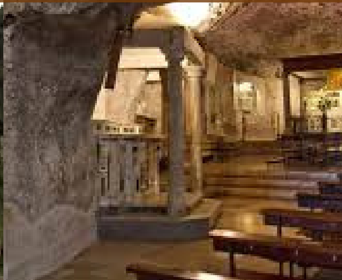
3 Cave of St. Michael the Archangel