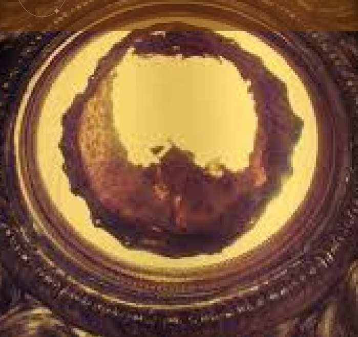
2 Eucharistic Miracle of Lanciano